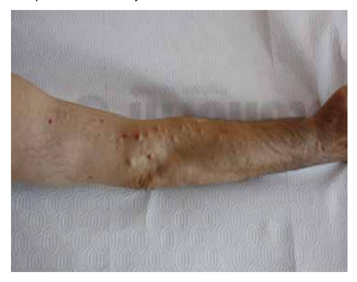
Figure 1. Dome-shaped, skin colored or reddish nodules arranged linearly in a dermatomal distribution from the right shoulder to the dorsal aspect of the right hand

Patients who present with only neurofibromas, need to be examinated carefully for the criteria of generalized form of NF-1 and should be followed to detect any systemic complications that may occur.